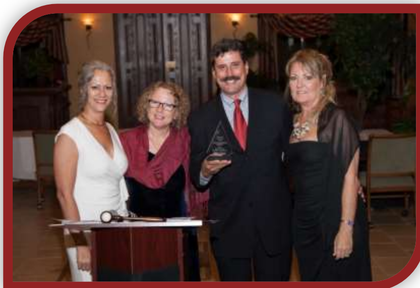
Accepting the Sun City Center Chamber of Commerce Non-Profit of the Year Award.