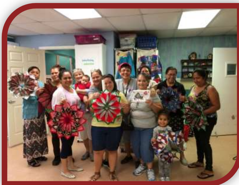
Sewing Class students with their crafts for the Market