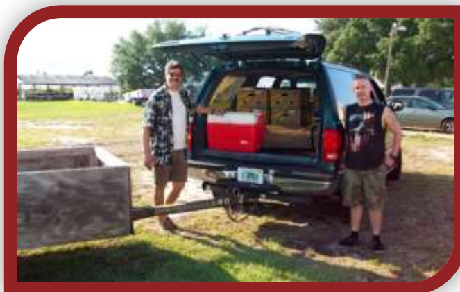
Getting ready to head out to the Postal Food Drive