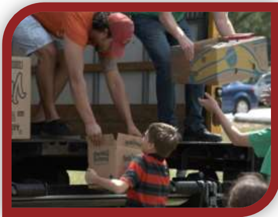
Feed the Bay unloading

Gifts-in-kind donations are acknowledged with an official receipt and contributions of goods are deductible for income tax purposes to the extent allowed by law.