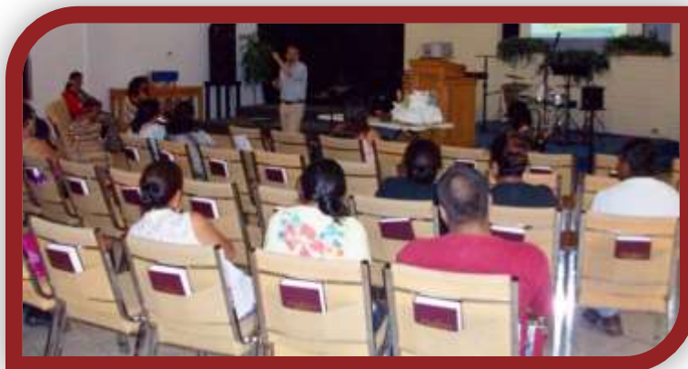
Pesticide Poisoning Prevention Class