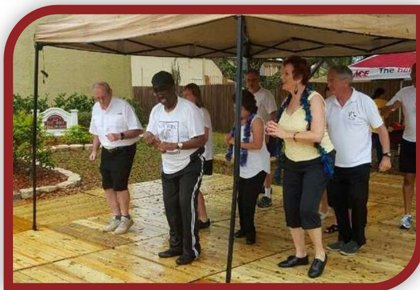
JSA Salsa Dancers