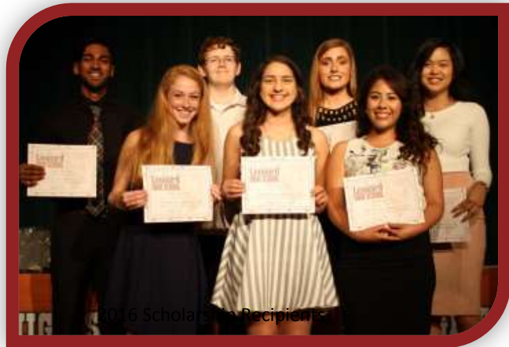
2016 Scholarship Recipients