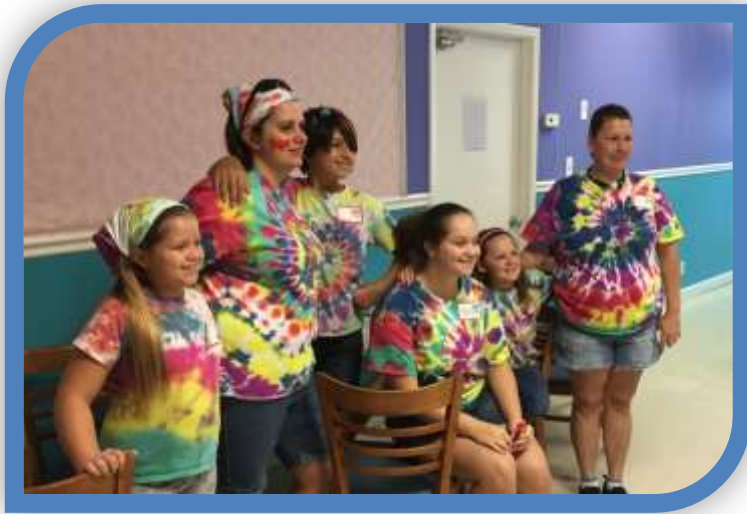
Girl Scout Troop 405 Face Painters

The Good Samaritan Mission's Annual Back to School Outreach Event was held on Saturday, August 15, 2015. We had 732 people attend the event as registered guests. Each of the 500 children received a backpack, hygiene items and school supplies. We were able to bless several area schools with left over supplies. The event also featured lunch, cupcakes, crafts, face-painting, carnival games and prizes, haircuts and mini-manicures. Several vendors were also on hand to provide information on the community resources that are available locally. Not only did the families receive backpacks that day, but our vendors were able to provide them with resources that will be helpful for the entire school year. Backpacks, supplies, hygiene items and lunch were all funded by a generous grant from the Community Foundation of Tampa Bay.