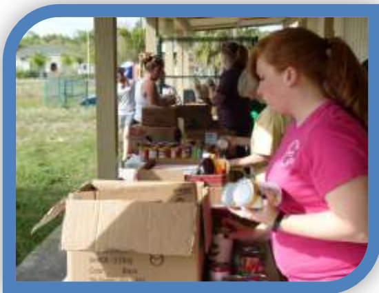
Feed the Bay sorting

Gifts-in-kind donations are acknowledged with an official receipt and contributions of goods are deductible for income tax purposes to the extent allowed by law.