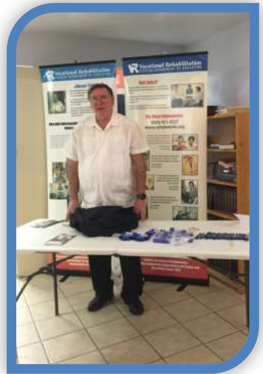
Florida Division of Vocational Rehabilitation