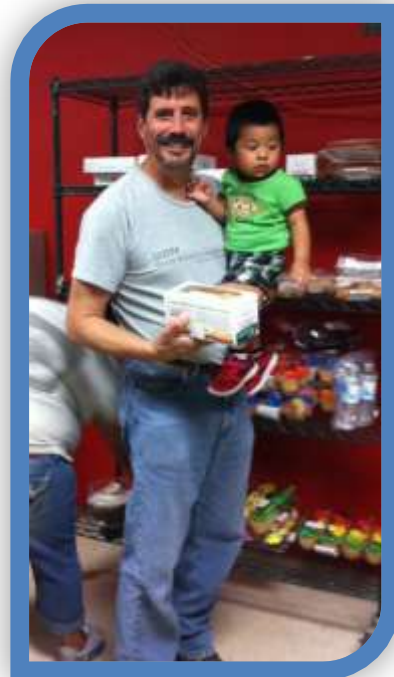
Bill and one of our store customers