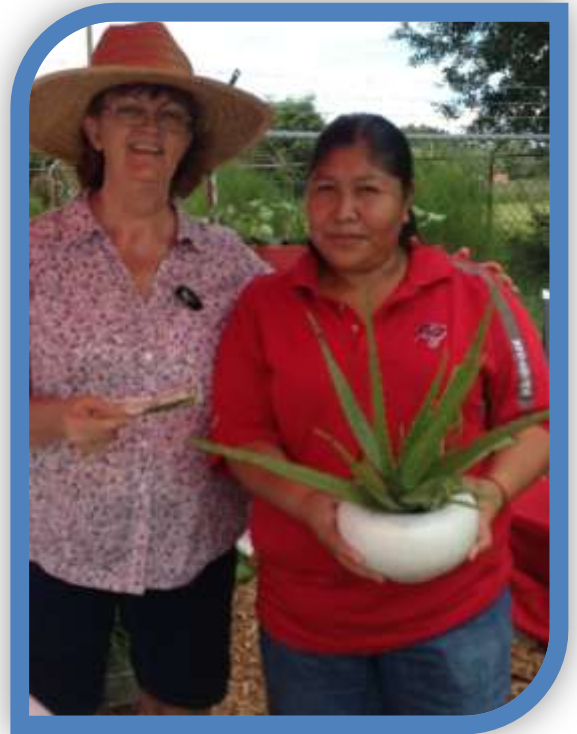
GSM FM's first sale