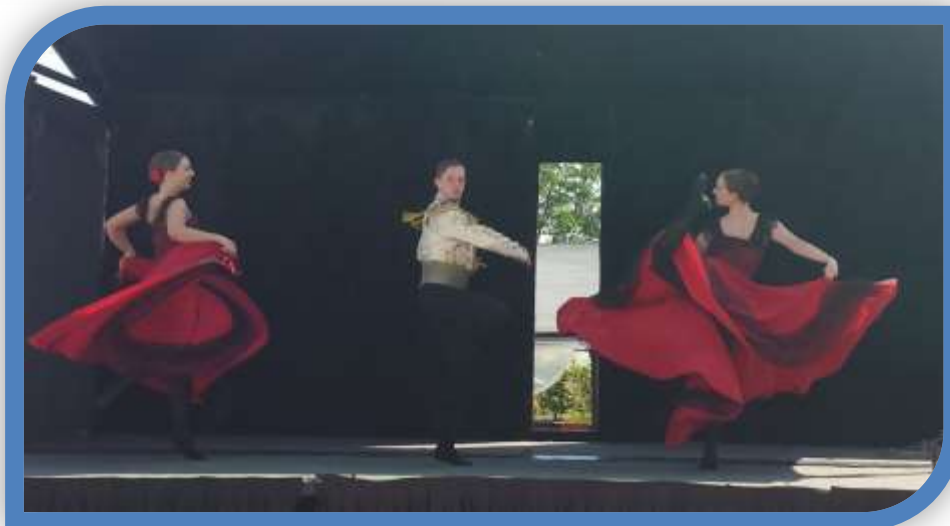
The Brandon Ballet