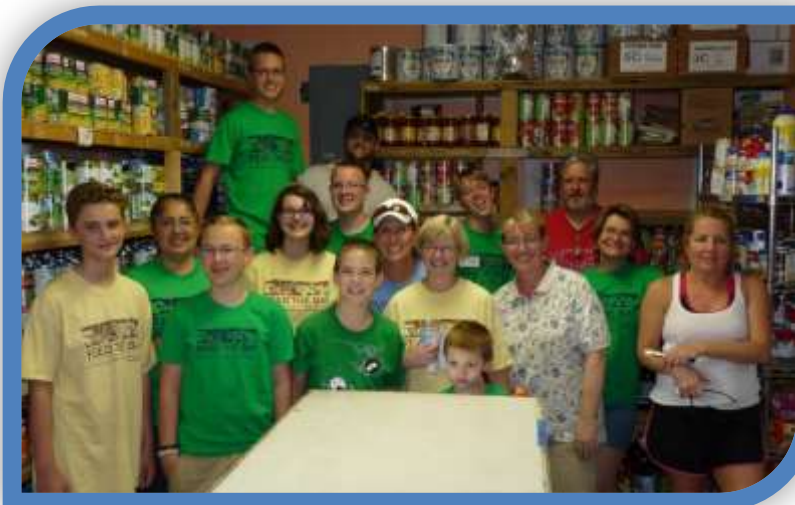
Feed the Bay Volunteers

We are proud to offer countless ways for our friends to come and find their purpose at the Good Samaritan Mission.