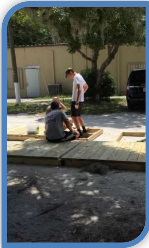
Team Effort Volunteers